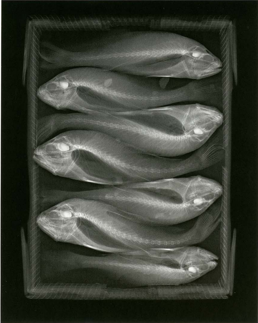
FISH BOX, 2011 Carbon on cotton print 29.83 x 24 inches