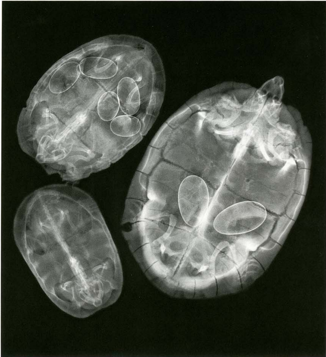
TURTLE EGGS Carbon on cotton print 24 x 24 inches