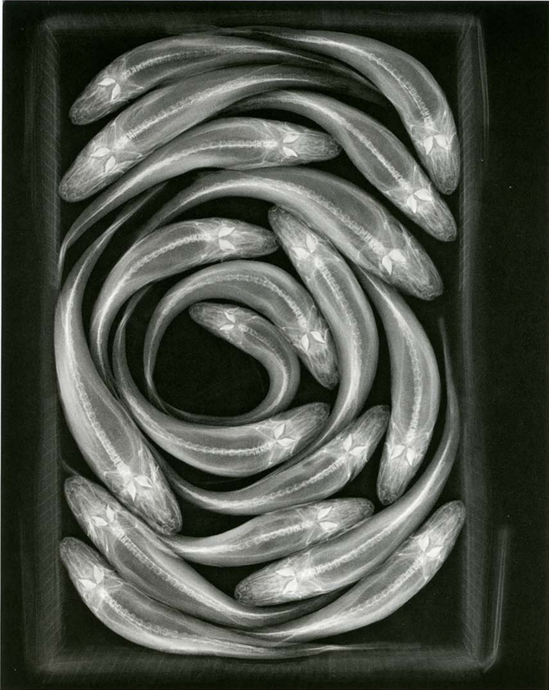
FISH CIRCLE, 2011 Carbon on cotton print 29.83 x 24 inches