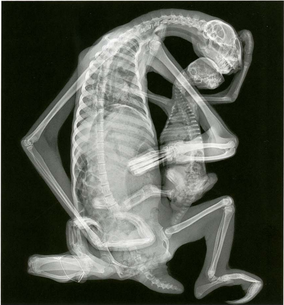
SLOTH PIETA, 2011 Carbon on cotton print 26 x 24 inches